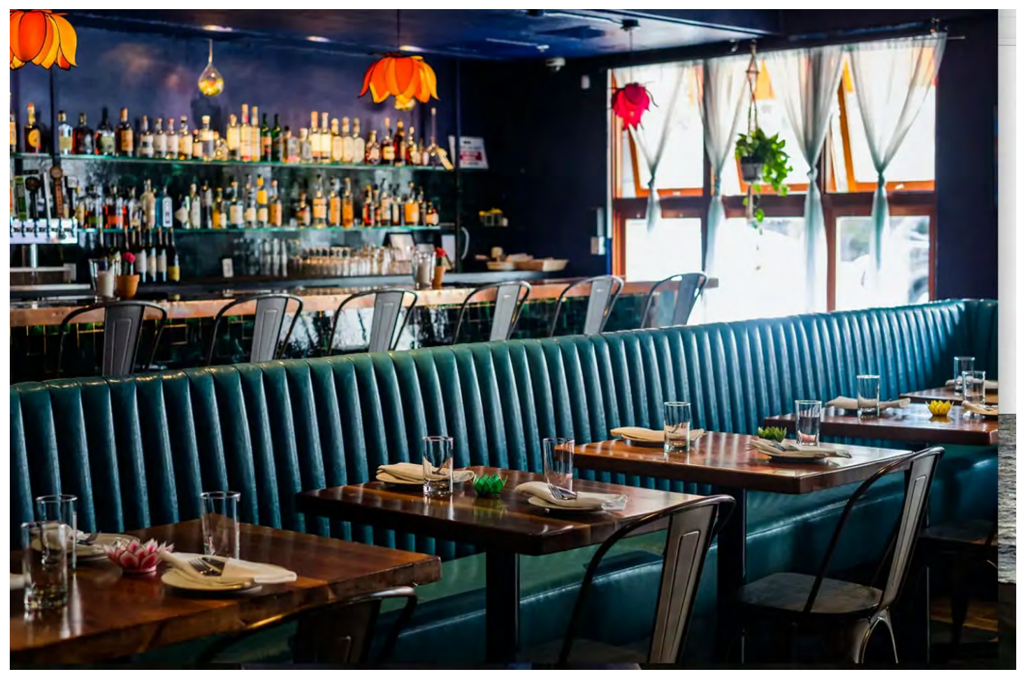
Yellow velvet chairs and a blue dining room fuel the moody first-date vibes at Dancing Yak.

For a first date that's off the beaten track, head to <u>Dancing Yak</u>, a <u>restaurant inspired by the mountains of Nepal</u>. Get comfortable in the yellow velvet chairs and sip on colorful cocktails like the bourbon-forward Don't Talk Yak or the mezcal-fueled Spicy Yeti while snacking on juicy momos (dumplings) in spicy tomato sauce. You can graduate to curries and biryanis if things are going exceptionally well.