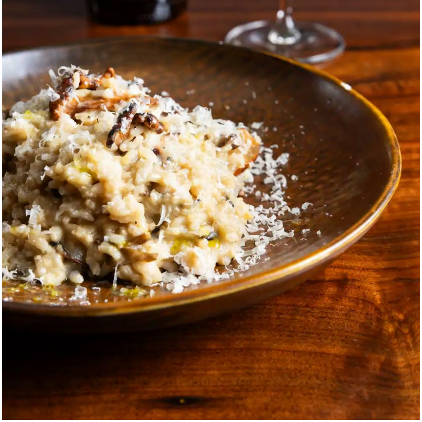
Couples get cozy with local wines and mushroom risotto at Cultivar.

<u>Cultivar</u>'s unassuming modern facade doesn't exactly scream romance. But in-the-know locals head to the Californian spot for a table on the back patio —a surprisingly lush and private escape. Here, the oversized fireplace is the low-key star, creating a charming mood to go with Cultivar's small-batch wines and seasonal dishes . Standouts include New York steak with chimichurri, mushroom risotto, decadent made-for-sharing cheese and charcuterie boards.