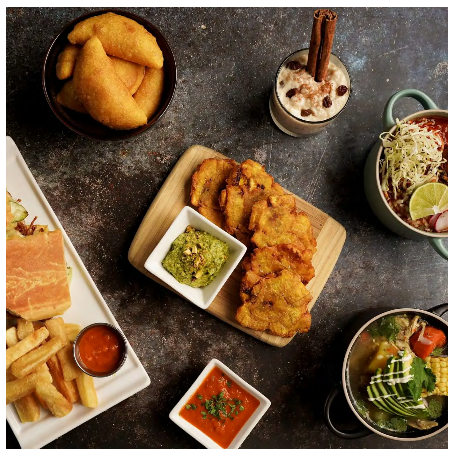
Pink, yellow, and teal colors splash across the interiors at iChao Pescao!

For a crowd-pleasing Latin-meets-Carribbean destination – pull up at <u>iChao Pescao!</u> (Civic Center/Hayes Valley/Van Ness)