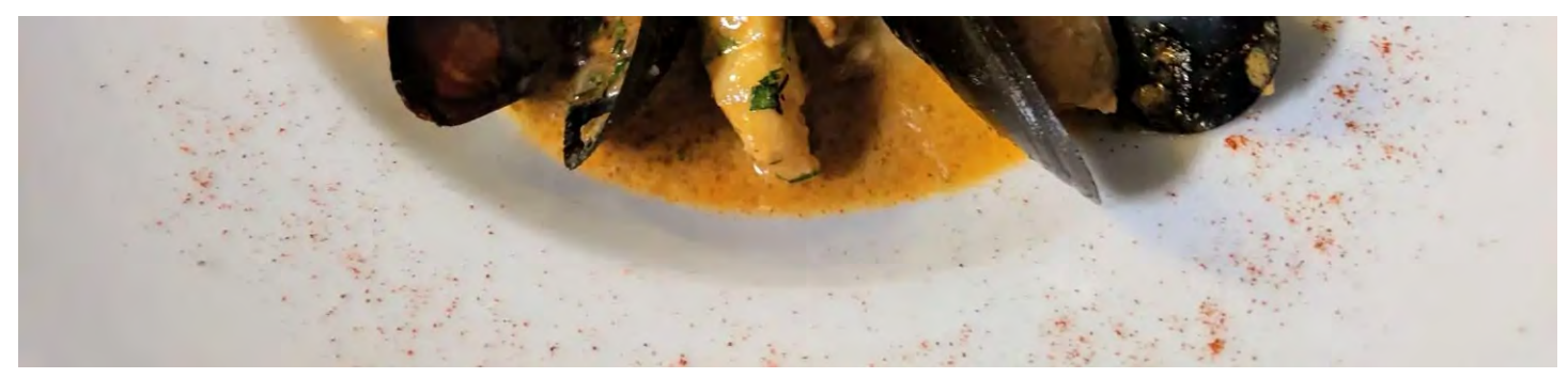
A seafood stew brimming with prawns and mussels at L'Ardoise.

This neighborhood gem is the quintessential French bistro . "L'Ardoise" means "chalkboard," evoking scribbled menus in Parisian restaurants. The petite dining room is filled with cozy corners for snuggling , and it's the rare SF restaurant where you can actually hear your date. But you'll find yourself leaning in anyway, drawn to steak frites or duck confit in the glow of candlelight.