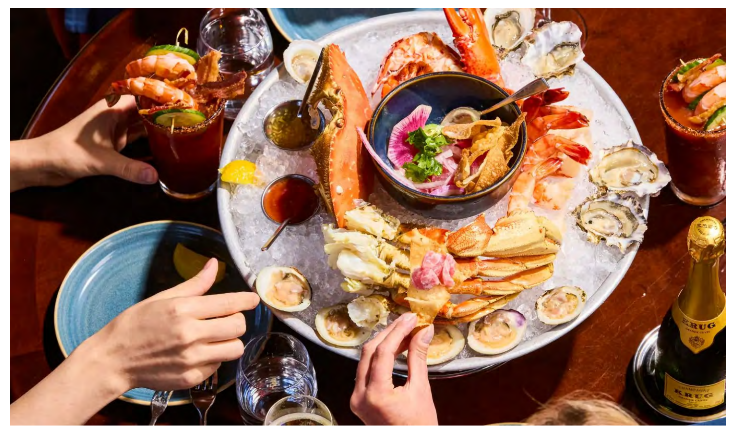
Feast on luxe seafood with sweeping views at local favorite Waterbar.

Every diner seems to be celebrating something at this splashy, Pat Kuleto-designed place, all nautical dark wood finishes and floor-to-ceiling aquariums. With its flawless seafood menu and prime seats for watching boats float under the Bay Bridge, <u>Waterbar</u> is a sought-after proposal spot. Don't miss the chandelier with glowing orbs—a subtle nod to the restaurant's extensive caviar program .