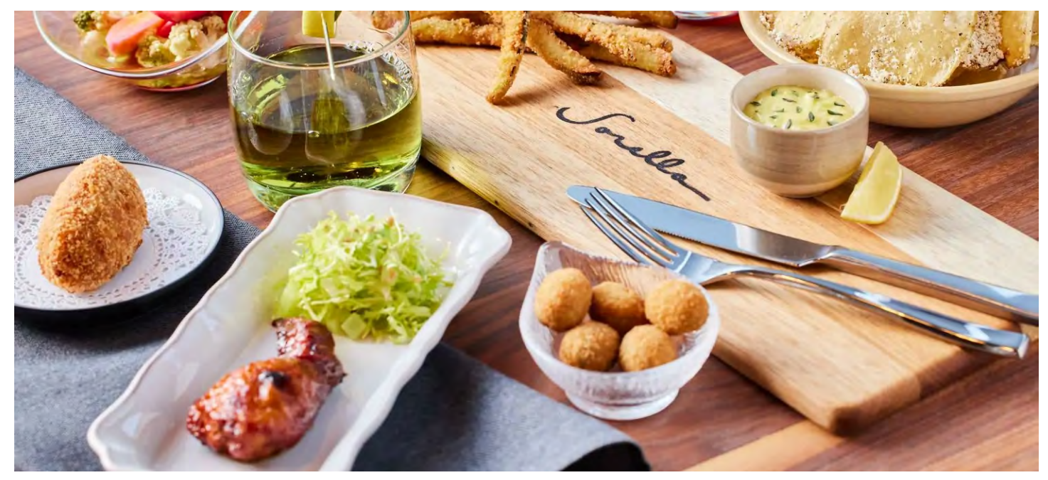
A selection of cicchetti, or Venetian-inspired small plates, at date-night spot Sorella.

The little sister spinoff of MICHELIN-Starred <u>Acquerello</u>, <u>Sorella</u>'s cicchetti— Venetian-inspired cocktails and snacks —make it an ideal spot for a second date. Slide into the bar for a casual drink, and have fun sampling the amaro paired with small plates like arancini and anchovy toast with cultured butter. Plus, it's a quintessential Streamline Moderne building, if you want to test your date's taste in SF architecture.